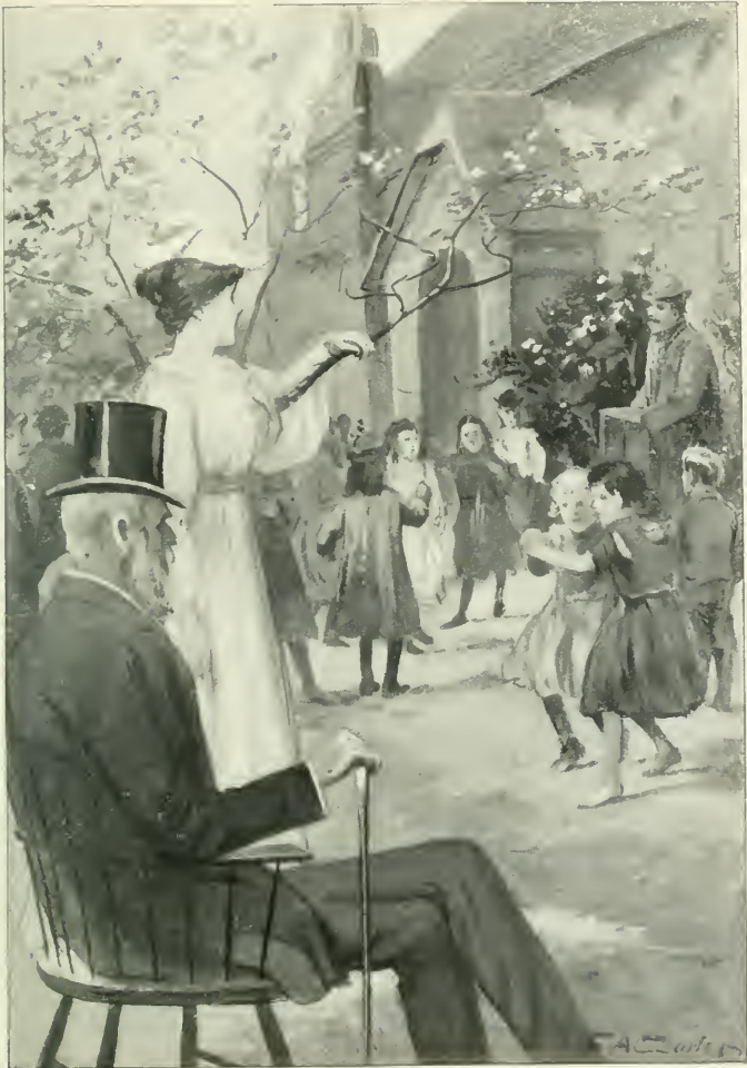
A Garden Party.—Page 273